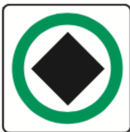
Dangerous goods route