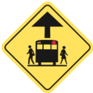
School Bus stop ahead. Slow moving vehicle

Señales que aparecen en los tests y que pueden resultar diferentes de las españolas