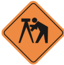
Survey crew ahead